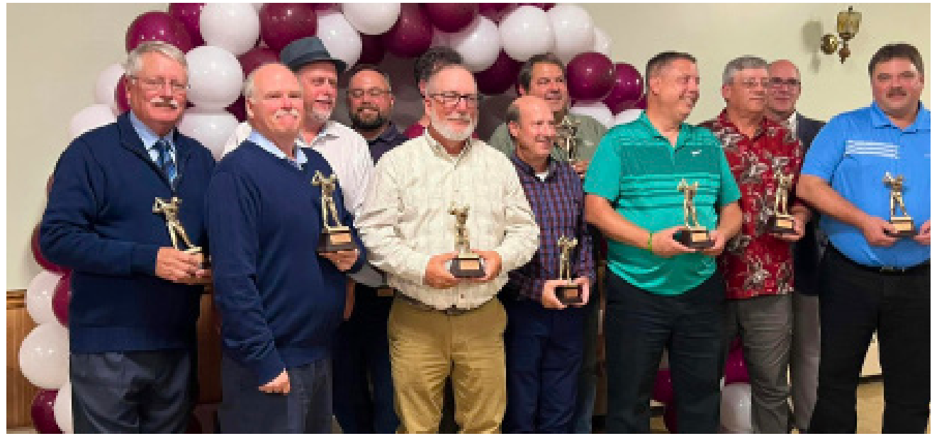
Legacy team members at the induction ceremony.